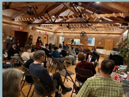
Photos from last year's Winter Social at Flinchum's Phoenix