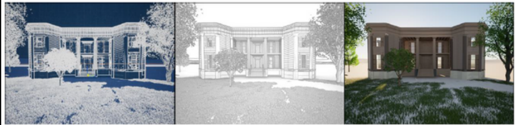
Exploring History with Digital Twins: Preserving Cultural Heritage Through Drone-Based 3D Modeling, Game Engines and Mixed Realities.